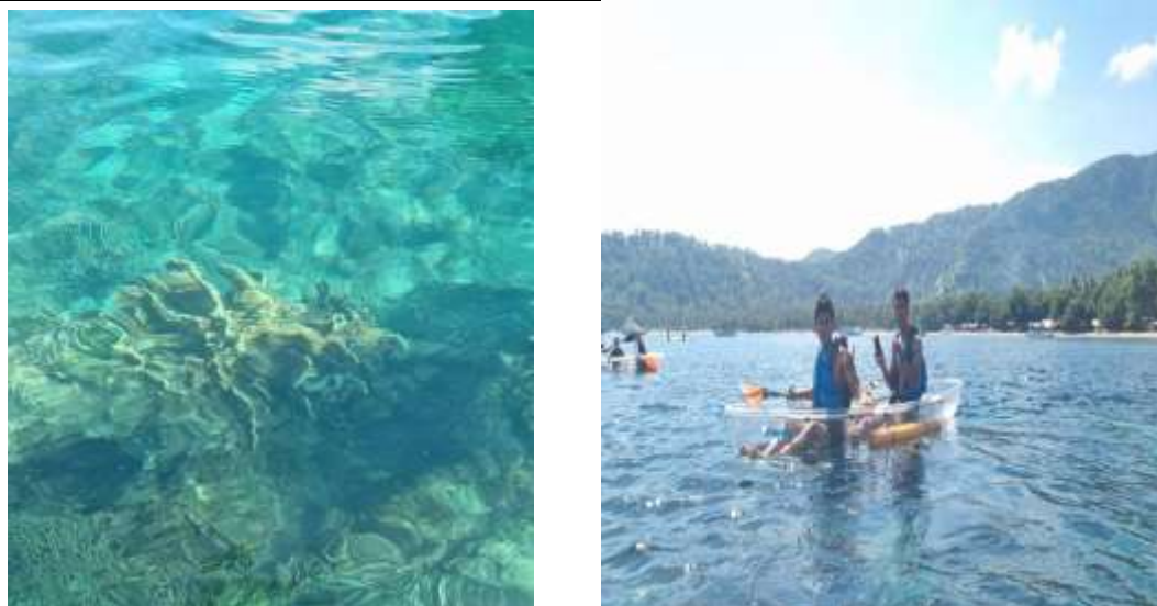
Figure 2. Nipah Beach Attraction

One of the most striking aspects of the area is its exceptional natural beauty, which serves as a key attraction for visitors and highlights the harmonious integration of land and sea. The destination presents a captivating combination of terrestrial and marine elements that together create a distinctive and memorable environment. Beneath the tranquil and transparent waters lies an extraordinary underwater world that enchants those who explore it. Within this realm, vibrant coral reefs spread across the seabed in complex and fascinating patterns, acting as both a shelter and a stage for a wide array of marine species. Various types of fish and other aquatic organisms can be observed moving gracefully through their natural ecosystem, giving life and color to an already stunning seascape. This vibrant marine biodiversity enhances the allure of the area and provides visitors with opportunities to experience nature in its most dynamic form.